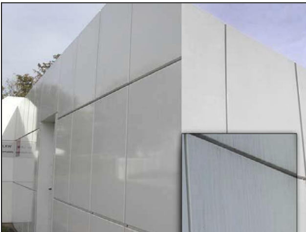
A coated Alu-façade after coating with UniCoat 2k Lacquer . (the section shows the degree of dirt before)