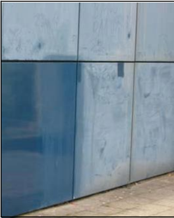
A bleached surface - before and after coating with UniCoat 2k Lacquer